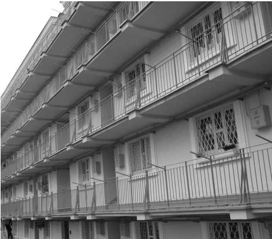
Figure 5.3a. The Muranów Estate. ‘Functionalism at a fancy dress party’. Architect Bochdan Lachert, 1948–1956. Modernist access balconies at the rear of one of the blocks.

Lachert to be ‘known for his obsequiousness’ (Tyrmand 1995 [1954]: 203, Piątek’s translation). Lachert’s architecture is said to carry a much more tangible testimony to this ‘obsequiousness’, however, than the verbal and textual declarations of the Syrkuses. Lachert agreed to change his original design for Muranów after 1949, but the alterations were introduced late, and could only be applied to the exterior facades of some of the buildings. This resulted in the earliest completed blocks in the complex, from 1950, featuring historicising detailing, bas-reliefs and neo-classical porticoes on one side, and taking the form of functionalist blocks with long access balconies on the other. Today, the architecture critic Jarosław Trybuś dismisses the estate’s architecture as ‘functionalism at a fancy-dress party’ after Tyrmand, who mocked it in his 1954 diaries as ‘reminiscent of a costume ball of schizophrenics posing as Napoleon, Julius Caesar and Nebuchadnezzar, with glued-on beards, eyebrows and moustaches, just like a small-town theatre’ (Tyrmand 1995: 103).