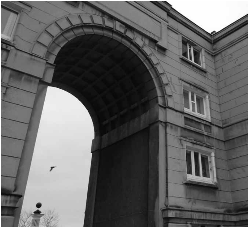
Figure 5.3b. The Muranów Estate. ‘Functionalism at a fancy dress party’. Architect Bochdan Lachert, 1948–1956. A grand entrance portico at the front.