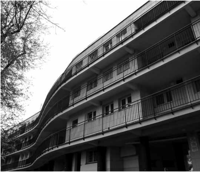
Figure 5.1a. From modernism to socialist realism. Koło II housing estate. Architects Helena and Szymon Syrkus, 1947–1951.