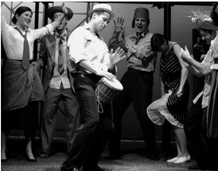
Figure 5.2b. The Trojan Horse of Modernism. Scenes from the musical Here Comes the Youth! depict stiff and repressed ZMP members before the World Youth Festival and ZMP members ‘injected with freedom’ once the festival is underway.