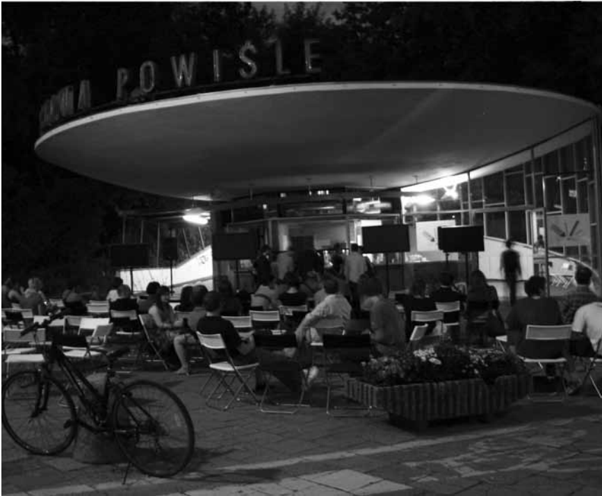
Figure 5.5b. An after-party at the station café.

The January 2008 demolition of the derelict Skarpa Cinema (built between 1956 and 1960) was similarly widely mourned. The elaborate mosaics from the interior of the cinema have been salvaged by a Warsaw hospice (Majewski 2009 in Gazeta Wyborcza ), and the giant neon sign that used to decorate the front of the cinema has found its way into the collection being assembled by Warsaw's Museum of Modern Art (see Fig. 5.6a). The first exhibition of the nascent collection organised at the museum's temporary home referred to the Skarpa neon sign as 'a testimony to the changes as a result of which many valuable examples of historical architecture and design are being destroyed as private investment aggressively pushes into public space' (Sztuka Cenniejsza Niż Złoto 2008). Both Supersam and the Skarpa cinema are now immortalised in an avowedly sentimental collection of six miniature ceramic replicas of PRI/era modernist buildings. The young designer behind the creation and marketing of the figures claims to have done so with the intention of making Varsovians 'reflect on the fact that these symbols of the city landscape may disappear irretrievably' (see Fig. 5.6a).