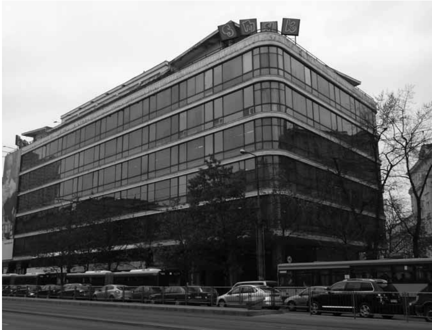
Figure 5.4a. The Central Department Store, Zbigniew Ihnatowicz and Jerzy Romański, 1948–1951. The CDT in 1951.

In order to shed some light on the complex medley of associations and connotations attached to the architectural ‘resistance movement’ in Warsaw, I want to look in more detail at a building which is frequently pinpointed as Warsaw’s foremost piece of ‘actively rebellious’ architecture, the city’s first post-war Central Department Store (see Fig. 5.4a). Designed by Zbigniew Ihnatowicz and Jerzy Romański, the CDT ( Centralny Dom Towarowy ) was the winning entry in a contest organised by the Association of Polish Architects (SARP) in 1948, just before the introduction of socialist realism as the mandatory creative doctrine.