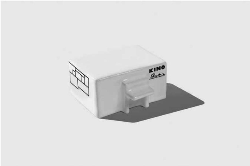
Figure 5.6b. Mourning modernism after the ‘period of devastation.’ A miniature ceramic replica of Kino Skarpa, designed by Magdalena Łapińska, 2009.

the fastest level since 1989, and the potential for profit has increased with an exponential growth in consumption. How, then, is the recent popularity of PRL era modernist architecture to be explained?