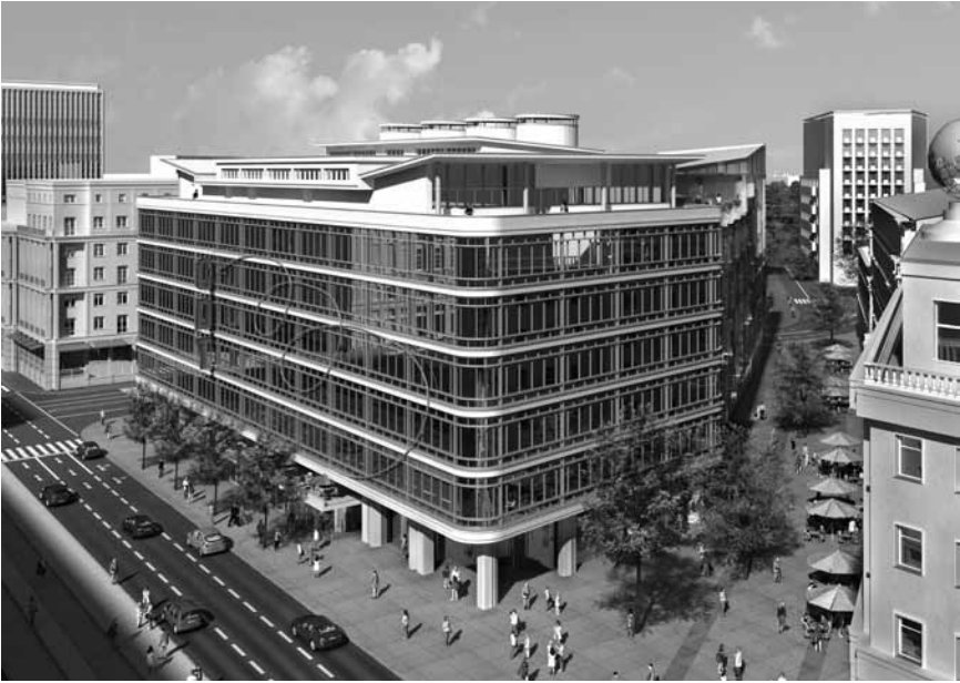
Figure 5.4b. The Central Department Store, Zbigniew Ihnatowicz and Jerzy Romański, 1948–1951. The CDT today; a visualisation of the refurbished CDT.

was showered with damning statements: ‘There is no doubt’, according to one architect participating in the discussion, that the CDT’s architecture ‘is clear formalism and cosmopolitanism of the purest kind’ (SARP 1952: 100). In a statement that has been gleefully appropriated by the CDT’s admirers today, another architect declares, ‘There could hardly be any more drums and cymbals amidst this jazzy clamour’ (1952: 100). Despite these routine condemnations, the CDT was doggedly completed at the end of 1951, without any substantial changes being made to the original design (Leśniakowska 2003: 34).