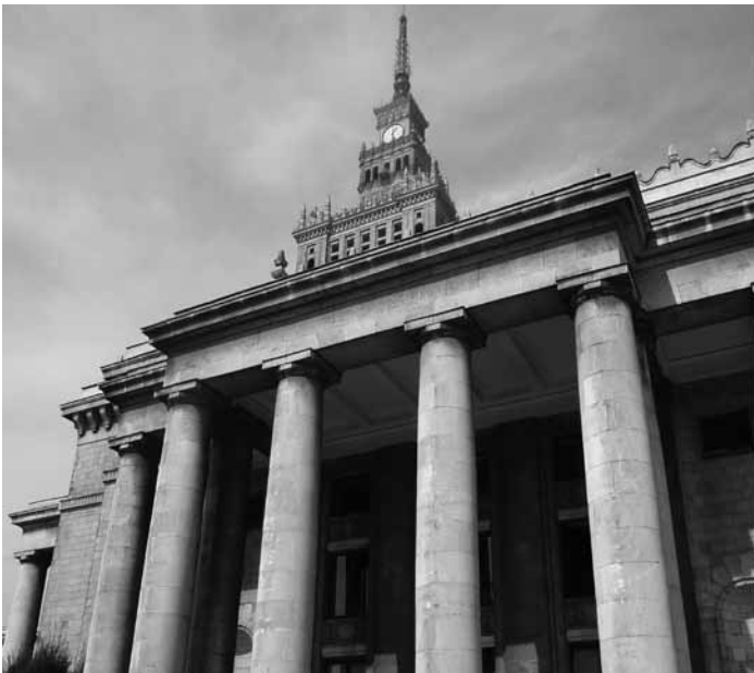
Figure 5.1b. From modernism to socialist realism. Palace of Culture and Science, Architect Lev Rudnev and others, 1952–1955.