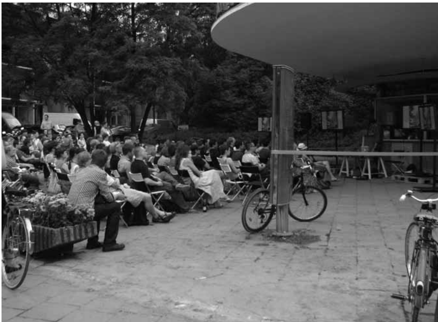
Figure 5.5a. A public meeting devoted to Warsaw modernist architecture at the Warszawa Powiśle station café.

The fate of Supersam, a supermarket designed as early as 1953 but only built between 1959 and 1962, sheds light on some of the circumstances leading to the development of this trend. Despite two years of intensifying dissent, Supersam was eventually demolished in December 2006 to make way for a large commercial and residential development. Supersam's passing was followed by a number of 'memorial' events, including a 'posthumous homage' in the form of an exhibition at the prestigious Kordegarda gallery (Kowalska 2007 in Gazeta Wyborcza ), and the act of its destruction is still regularly invoked with revulsion by the ever-more numerous defenders of PRL/era modernism. Piątek told me he considers the public outcry which followed Supersam's demise to have been a 'pivotal moment,' which resulted in an increased public awareness of the significance of Warsaw's modernist buildings in its architectural heritage.