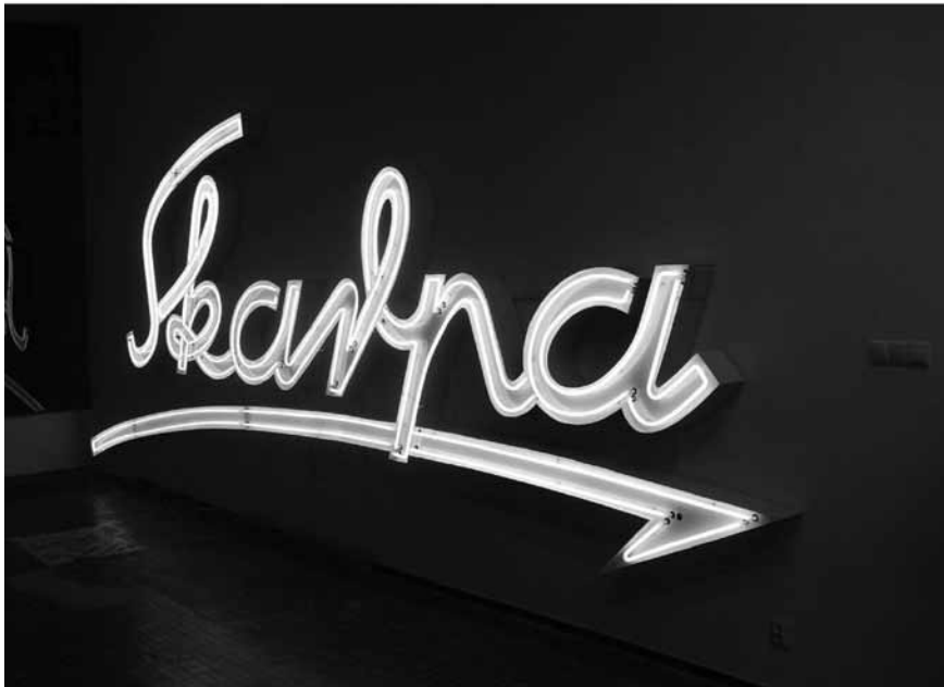
Figure 5.6a. Mourning modernism after the 'period of devastation'. The neon sign from the Skarpa cinema (architect Zygmunt Stępiński, designed in 1953, built 1956–1960, demolished in 2008) at the Museum of Modern Art, December 2008.

Piątek points out that the demolition of several important modernist buildings in the 1990s passed by unnoticed, with almost no significant discussions or protests in the everyday press, whereas the architect Andrzej Chołdzyński recalled that CDI's first question to him ('several years ago') regarding the CDT department store was concerned with how it could be most effectively torn down. In 2004 and 2006, however, the firm willingly participated in the process of placing CDT (as well as several of its other Polish properties) under the protection of the register of historical monuments. According to one journalist, things have changed since the 'period of devastation' during the 1990s and early 2000s. Debates in architecture are ahead of those between politicians, and 'the climate of reckoning' has given way to a more 'tolerant, relativistic' atmosphere (Jarecka 2007 in Gazeta Wyborcza ). This trend towards a more careful, allegedly 'mature' attitude to the past is developing despite the fact that, as one critic pointed out, brute market logic should dictate that twentieth-century architecture is more at risk in Warsaw than anywhere else in Poland, and more in the last few years than ever before (Majewski 2006 in Gazeta Wyborcza ). Since Poland's entry into the European Union, ground rents have been rising at